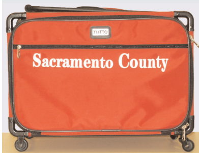
Red Supply Bag