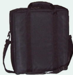
Precinct Scanner in Soft Case