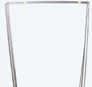
Wire Frames (4)

Remember: Election equipment must be in a secure location at all times. Do not store election equipment or materials in a vehicle.